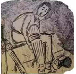
a short collection of verse Gascard Drew