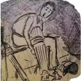
a short collection of verse Gascard Drew